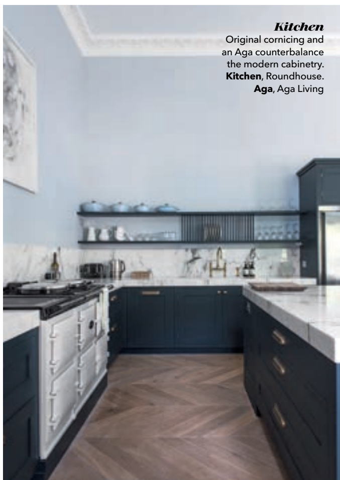
Kitchen Original cornicing and an Aga counterbalance the modern cabinetry. Kitchen , Roundhouse. Aga , Aga Living