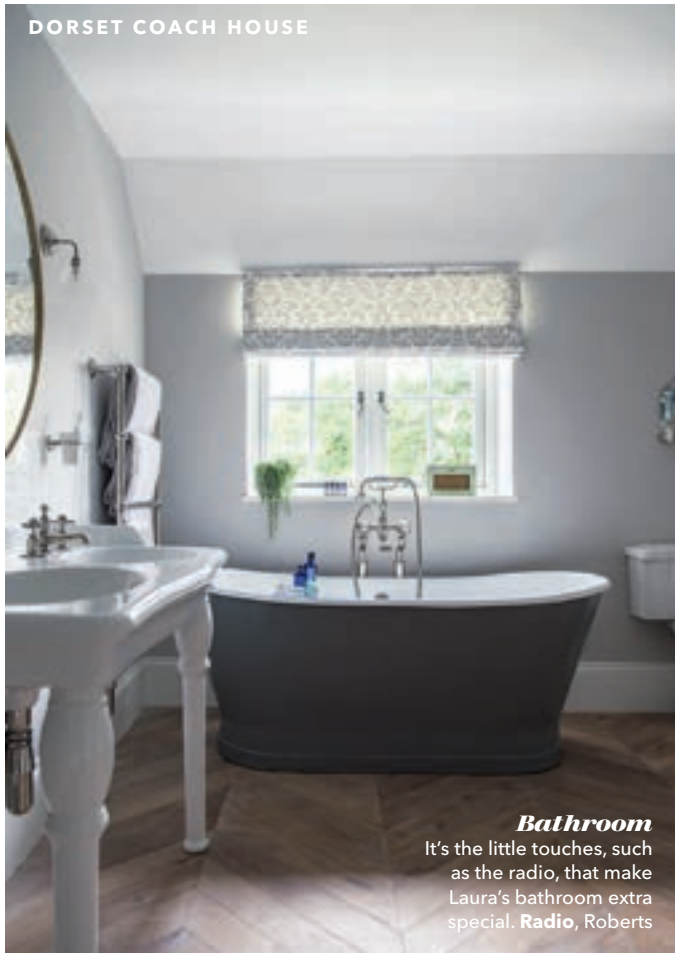
Bathroom It's the little touches, such as the radio, that make Laura's bathroom extra special. Radio , Roberts