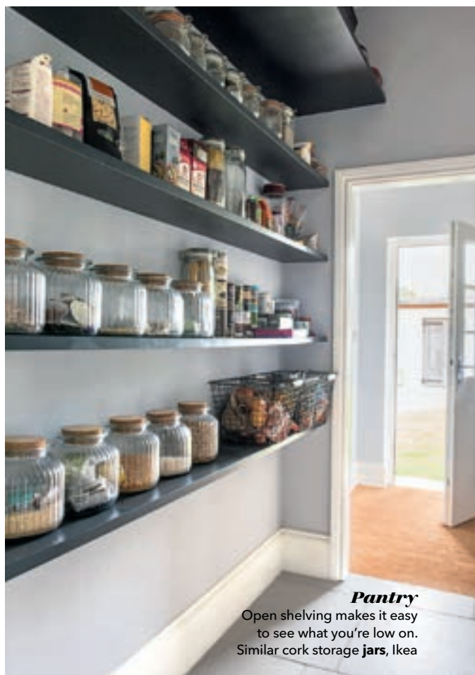
Pantry Open shelving makes it easy to see what you're low on. Similar cork storage jars , Ikea

T his elegant Dorset dwelling wasn't always the epitome of country sophistication that it is today. Originally built as a coach house in the 1850s, the property was later converted into flats during the Seventies and hadn't been updated since. 'I was trawling a property website one day when I spotted this unique building,' says Laura Butler-Madden. 'It was rather in need of love, but we decided to take a look.'