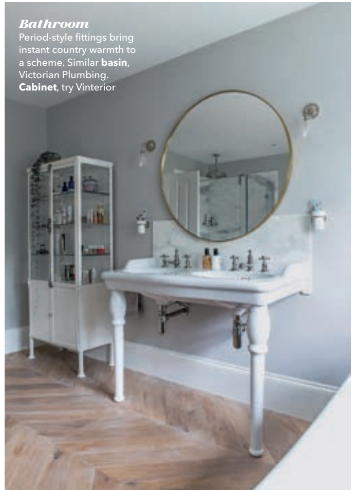
Bathroom Period-style fittings bring instant country warmth to a scheme. Similar basin , Victorian Plumbing. Cabinet , try Vinterior

marble, and brought in some quirky, characterful artwork and pieces of furniture to give the scheme real personality.