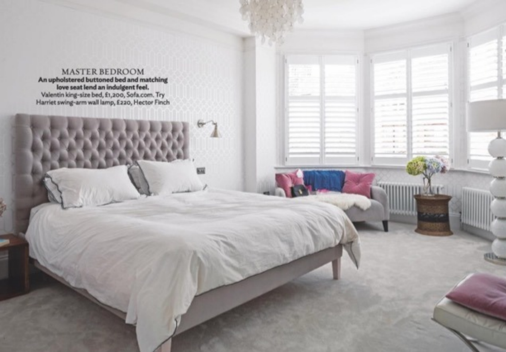
MASTER BEDROOM An upholstered buttoned bed and matching love seat lend an indulgent feel. Valentin king-size bed, £1,200, Sofa.com. Try Harriet swing-arm wall lamp, £220, Hector Finch